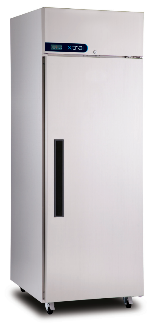
XR600H 600 litre capacity cabinet