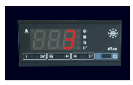
Microprocessor controller provides simple accurate temperature control