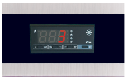
Microprocessor controller provides simple accurate temperature control