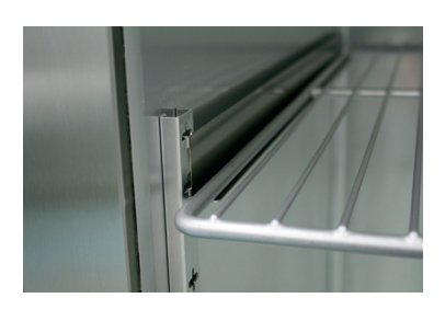
Gastronorm shelving is supplied with both sizes of cabinets, 3 for the 600 litre model and 6 for the 1300