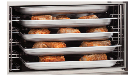
75mm shelf spacing maximises capacity

Microprocessor controls provide foodsafe chilling from +70^{\circ} C to +3^{\circ} C in 90 minutes