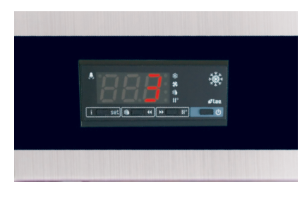
Microprocessor controller provides simple accurate temperature control