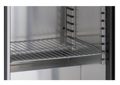
4 x Nylon coated wire shelves (480 x 420mm)

+ Product type is not currently regulated by Ecodesign