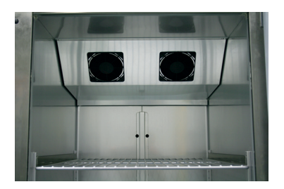
Refrigeration system maintains cabinet storage temperature in hot kitchens