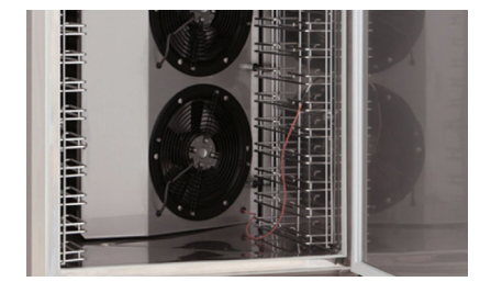
No visible screws or dirt traps for ease of cleaning