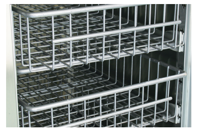
Basket drawers option allows storage flexibility

Refrigeration system maintains counter storage temperature in hot kitchens