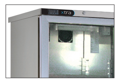
Glass door option also available (ambient operation up to 25°C)