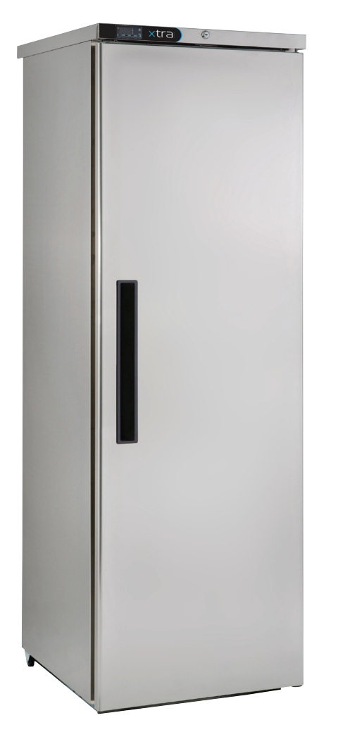
XR415H 400 litre capacity cabinet